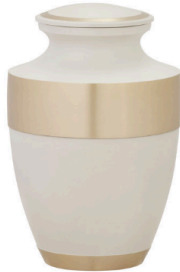
$325 - Adria White Brass