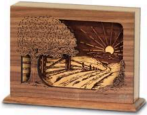
$645 - Country Roads Walnut Hardwood