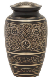
$465 - Midnight Ornate Etched Brass