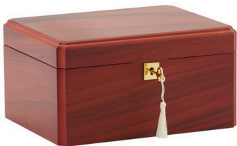
$465 - Renton Mahogany Veneer