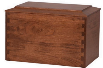
$645 - Revel Cherry