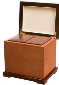
$645 - Harmony Companion Hardwood