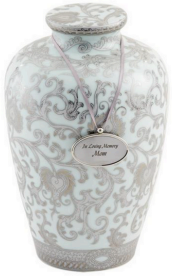
$465 - Scroll Porcelain