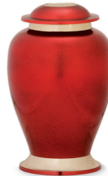
$330 - Avondale Sand-cast Brass