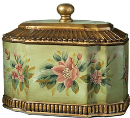
$365 - Green Flora Resin Cast