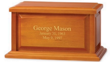
$335 - Albury Solid Hardwood