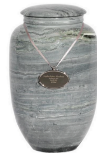
$645 - Forest Haze Solid Marble

* Assorted keepsake urns - Starting at $110