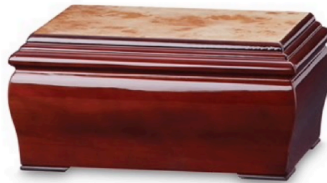
$365 - Burlson Hand-crafted Wood Veneer