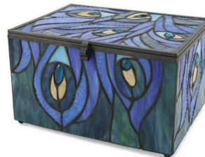
$465 - Peacock Memory Chest