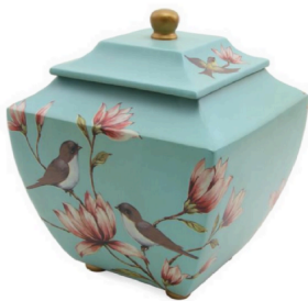
$645 - Magnolia Songbirds Resin