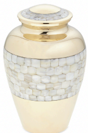
Mother of Pearl