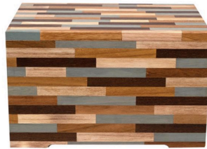
$645 - Tribute Mosaic Wood