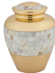
$465 - Mother of Pearl Metal