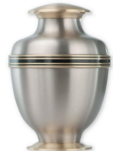
$465 - Venice Brass