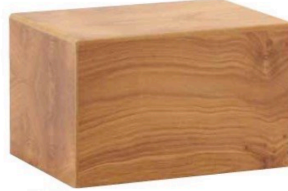
$240 - Natural Veneer Chest Veneer