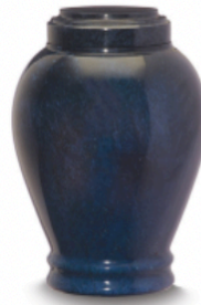
$465 - Embrace Blue Solid Stone