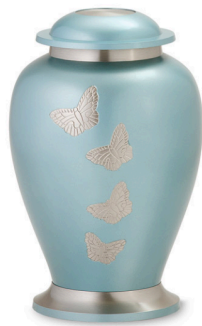
$645 - Avondale Teal Brass