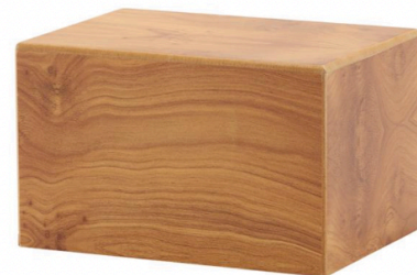
Natural Veneer Chest