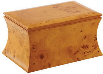
$465 - Bailey Burwood Veneer