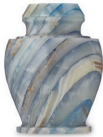
$645 - Carple Onyx Blue Stone