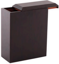
$240 - Spartan Dark Dark Veneer