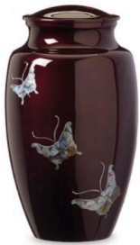
$305 - Purple Butterfly Aluminum